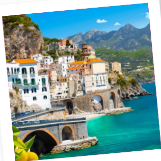
DAY 3 - AMALFI E POSITANO