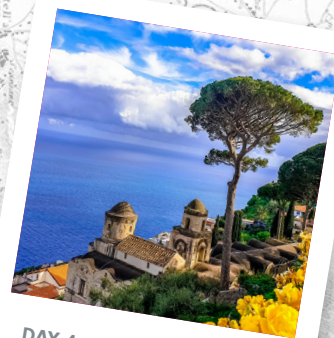
DAY 4 - AMALFI E RAVELLO