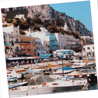
DAY 2 - CAPRI

Morning cruising and snorkeling- afternoon walking tour of the island